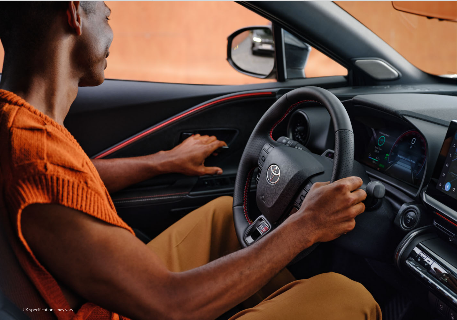
UK specifications may vary.