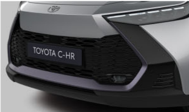
Fog lamp surround

Front bumper trim in piano black This piano black trim adds an eye-catching detail to your lower front bumper.