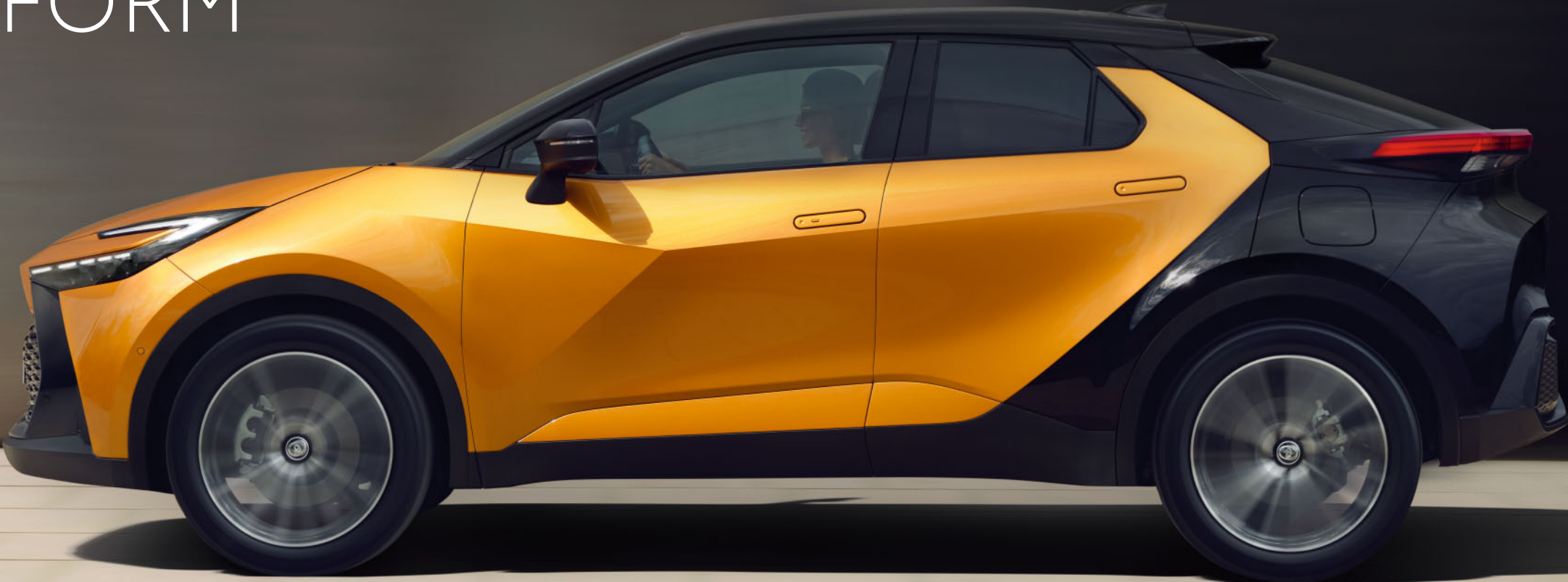
Model shown is Premiere Edition.

Drive electrified with Toyota's most advanced Hybrid powertrains yet. With compact motors and powerful high-voltage batteries, the new Toyota C-HR's Hybrid options deliver a balance of power and efficiency.