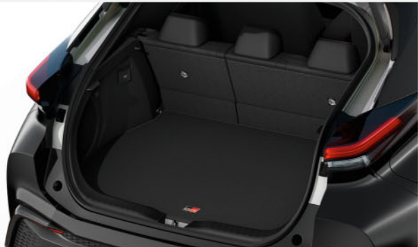
Boot mat (GR SPORT only)