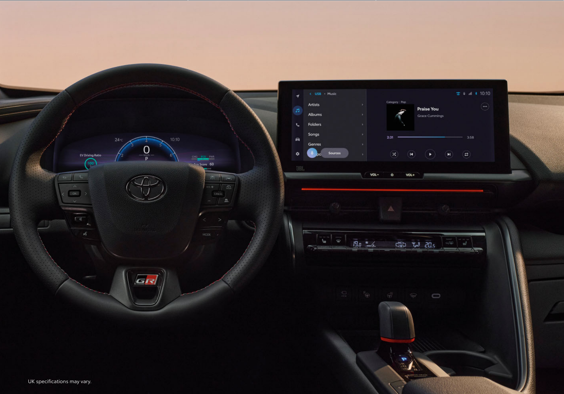
UK specifications may vary.