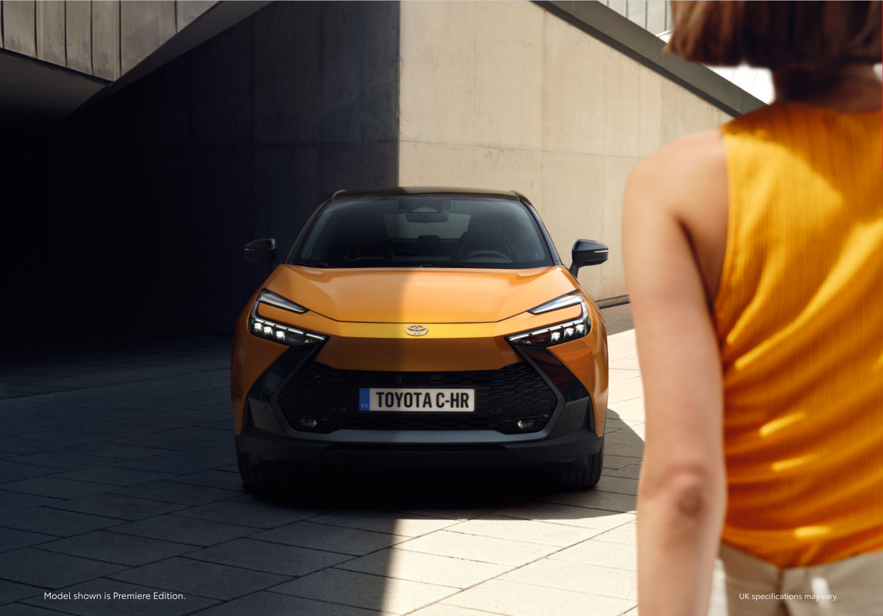
Model shown is Premiere Edition.