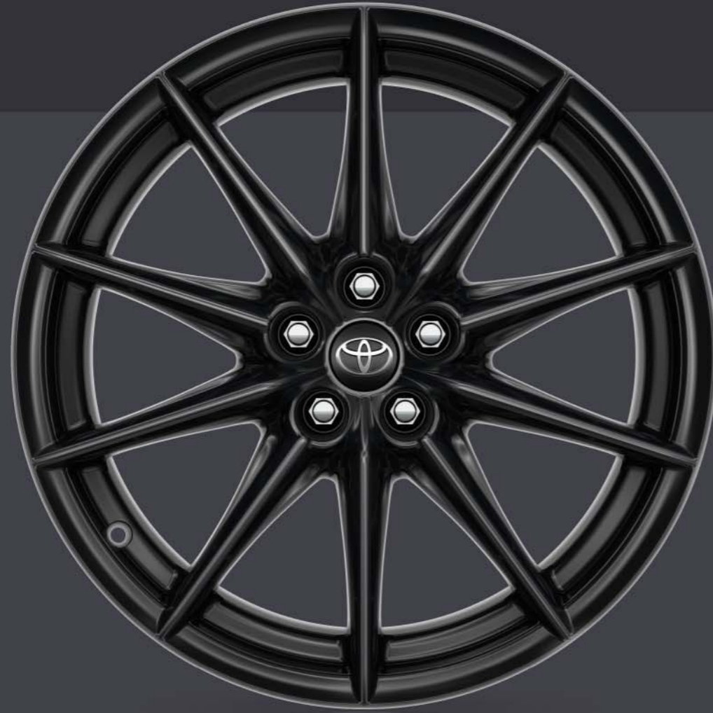
18" Black alloy wheels (10-spoke)