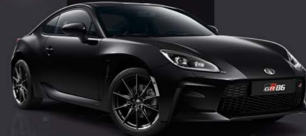
Crystal Black (D4S)*