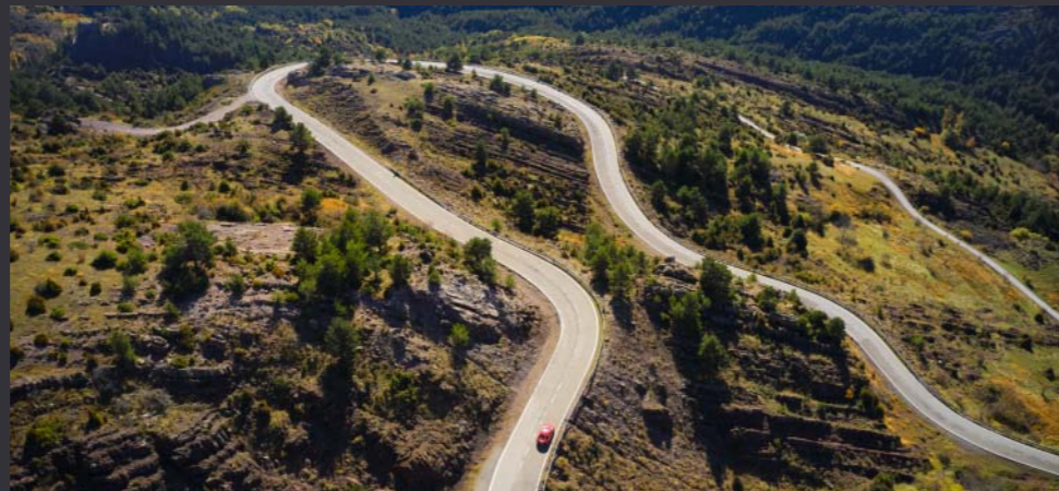
GR86's low centre of gravity makes handling corners effortless.

Enjoy driving our lightest coupe ever, with its horizontally opposed four-cylinder engine, the result is a truly rewarding driving experience.