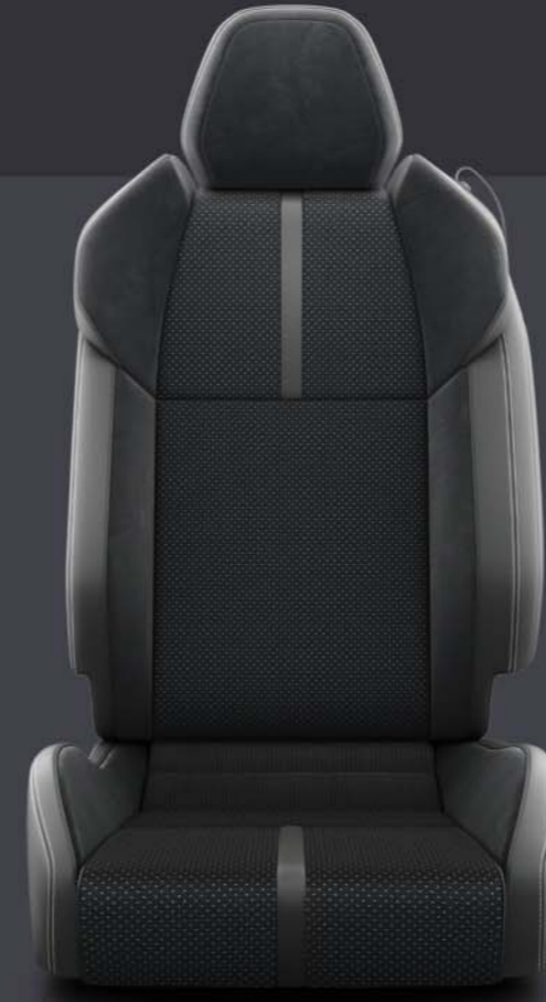
Ultrasuede & Leather Seats