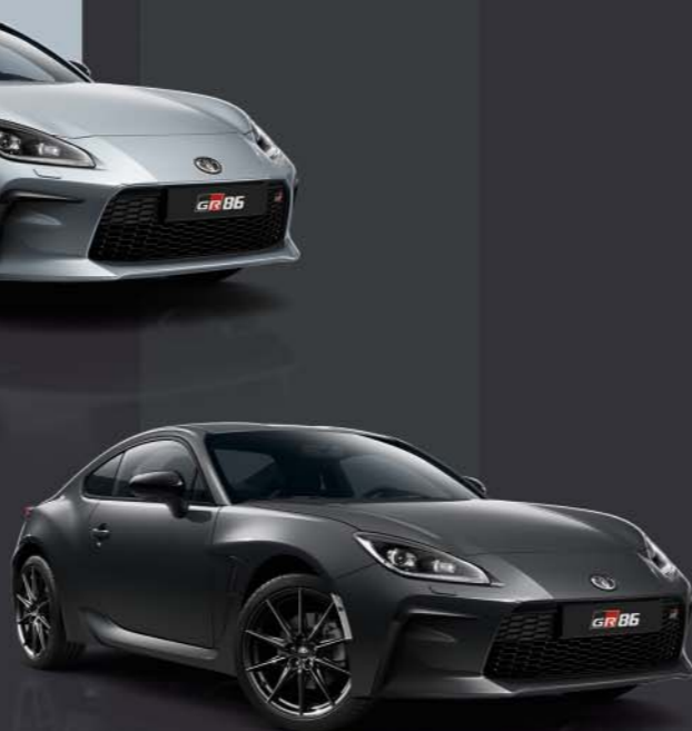
Magnetite Grey (P8Y)§