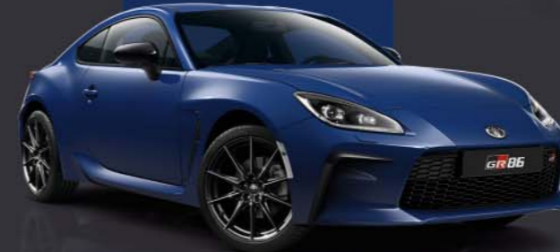
Sapphire Blue Pearl (WCH)*