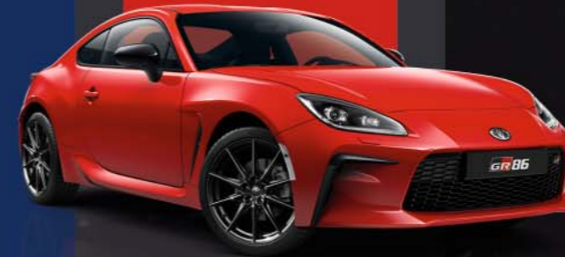
Ignition Red (DCK)*