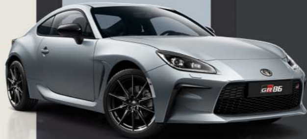
Ice Silver (G1U)§